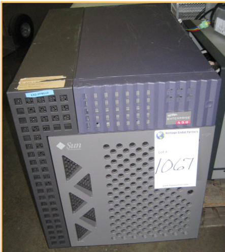
SUN ULTRA 450 SERVER

Lot – (30) Assorted IBM Docking Stations