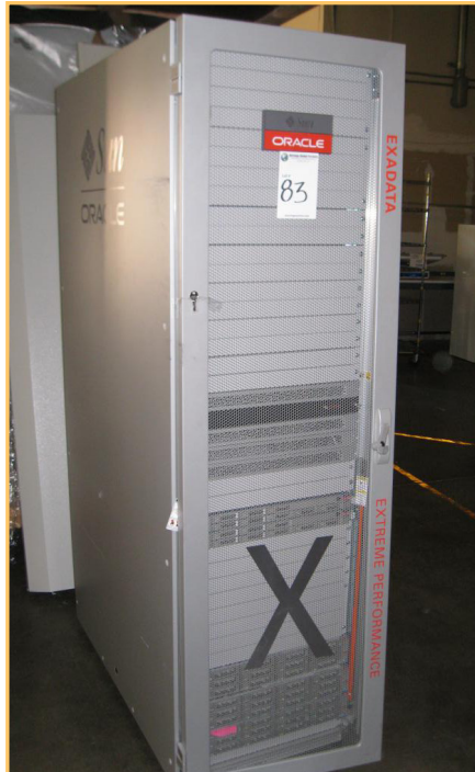
SUN/ ORACLE EXADATA CABINET