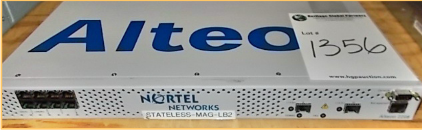
NORTEL ALTHEON-2208 APPLICATION SWITCH