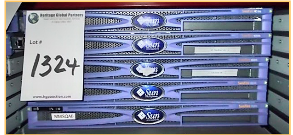
SUN MICROSYSTEMS SUNFIRE-V210 SERVER