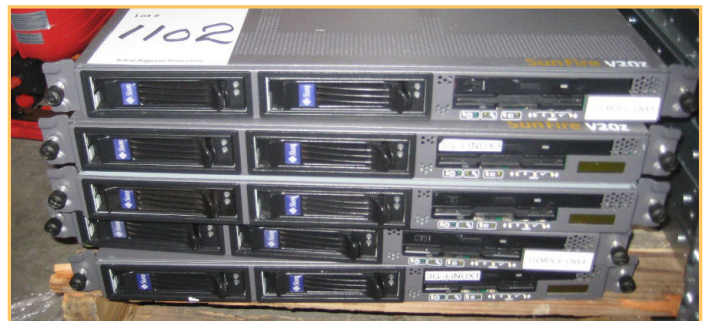
SUN #V20Z SUNFIRES RACK MOUNT SERVERS