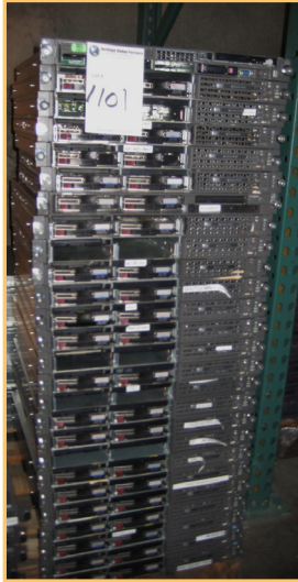
HP PROLIANTS # DL360 SERVERS