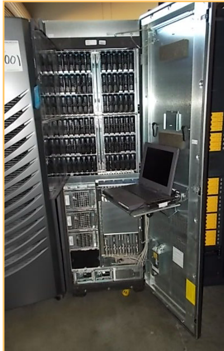
EMC SYMMETRIX DMX 1000 NETWORK SERVER CABINET