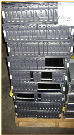
NETWORK APPLICATIONS DS 14 MKE