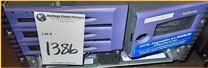
SUN MICROSYSTEMS SUNFIRE V490 SERVER