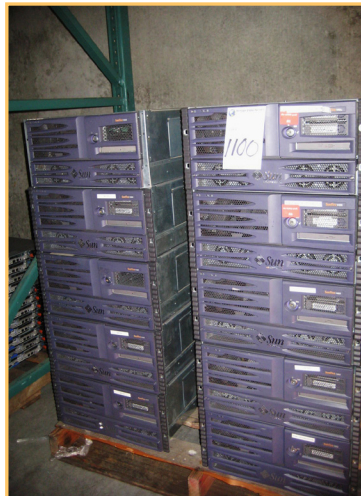
SUN # V480 SUNFIRE SERVERS