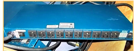
CYCLADE # PM20 ALTER PATH RACK MOUNT SURGE PROTECTORS

1 – Phoenix Capture-All Imaging Converter