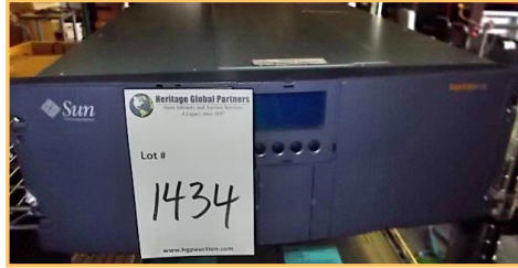
SUN MICROSYSTEMS STOREDGE-C4 TAPE LIBRARY