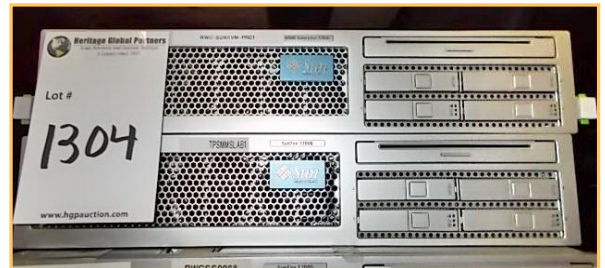
SUN MICROSYSTEMS SUNFIRE-T2000 SERVER