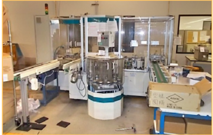
GIMA C0840 DISK PACKER (YEAR 1999)