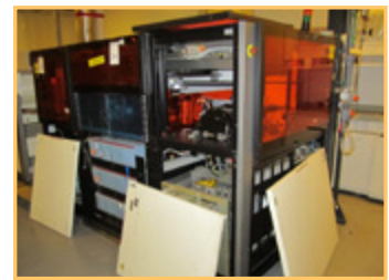
ODME / AUTOMATIC MASTERLINER AM-200 CD/DVD GLASS MASTERING SYSTEM