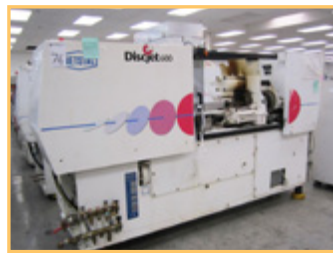
(6) STEAG FIRSTLIGHT UNIJET-60144 CD REPLICATION SYSTEM