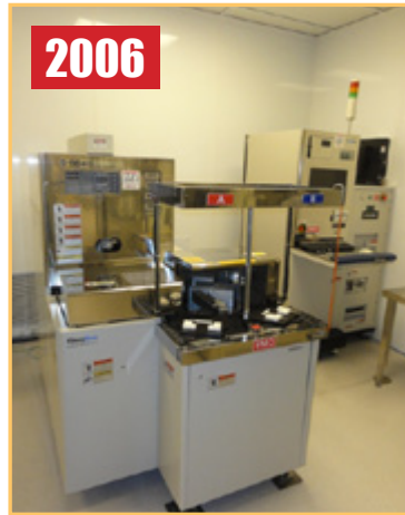
2006 HITACHI MODEL/SERIES S-8840 SCANNING ELECTRON MICROSCOPE