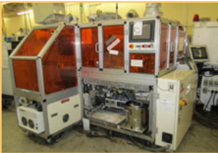
SONY OPS-D2ZOOM INLINE DVD BONDING/REPLICATION LINE

1 – Steag Hammatech UNIJET/60144 CD Replication System (S/N-003645) W/ Netstal Discjet 600/110 Injection Molding Machine ( S/N-9N.96192 ; Year 1996). With Sysco Temperature Controller.