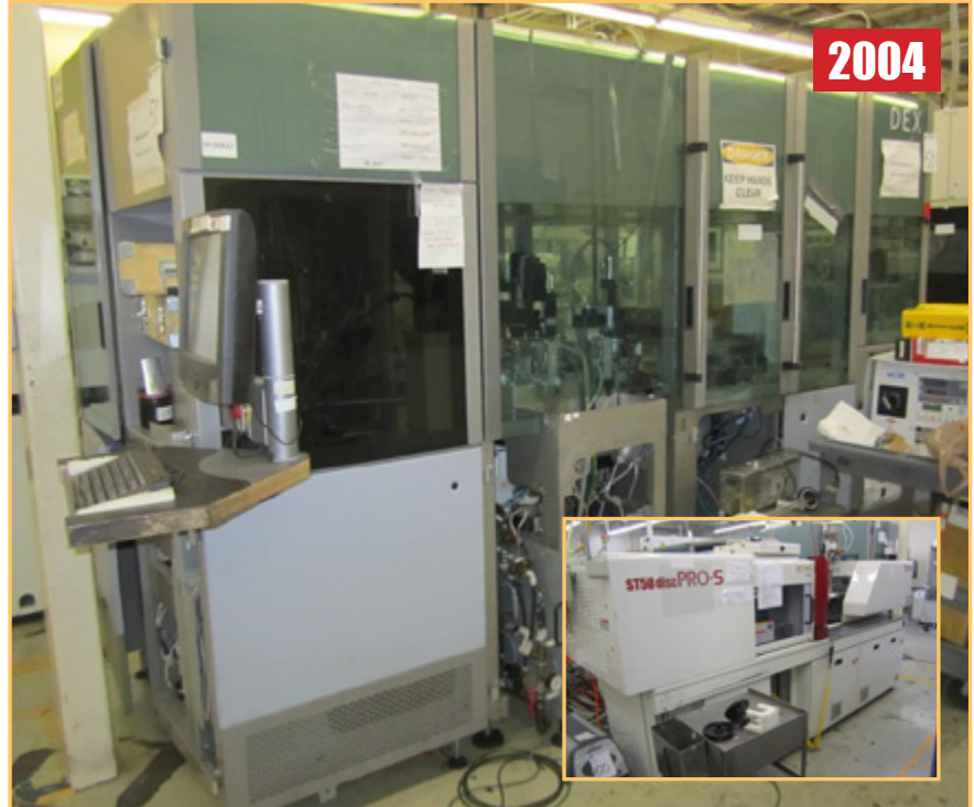
ODME DEX-1102/50 DVD-9 REPLICATION LINE (S/N-04-027, YEAR 2004)