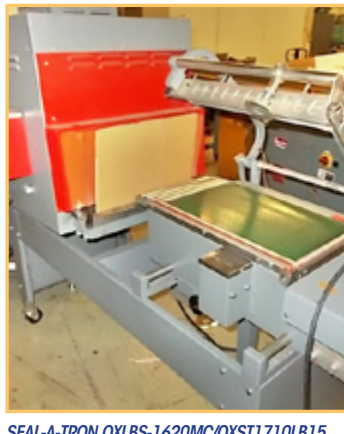
SEAL-A-TRON OXLBS-1620MC/OXST1710LB15 L-SEALER WITH SHRINK TUNNEL