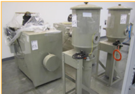
CONAIR POLYCARBONATE MATERIAL DELIVERY SYSTEM

2 – Yang SV-600 Business Card CD Cutter, With Fanuc Series-O-MD Control Panel; Year 2000