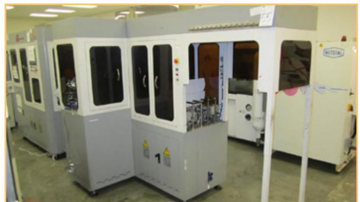
GUAN YINN GBD-22CA/GCL-22BA DVD REPLICATION/BONDING LINE

2 – Alpha Plating P5200 Nickel Sulphamate Plating Bench (3 Well) 1 – Digital Matrix Eform-Sa-Series Plating System. Consisting Of: (3) Electric Grade Sulfa Mate Nickel Sinks & (1) Wash Station.