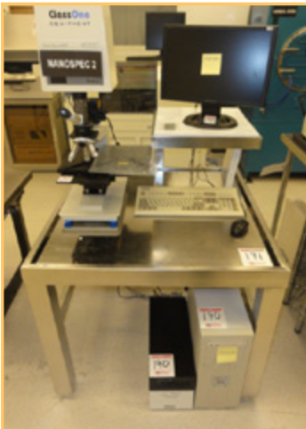
UNIVERSAL AXIAL INSERTION SYSTEM