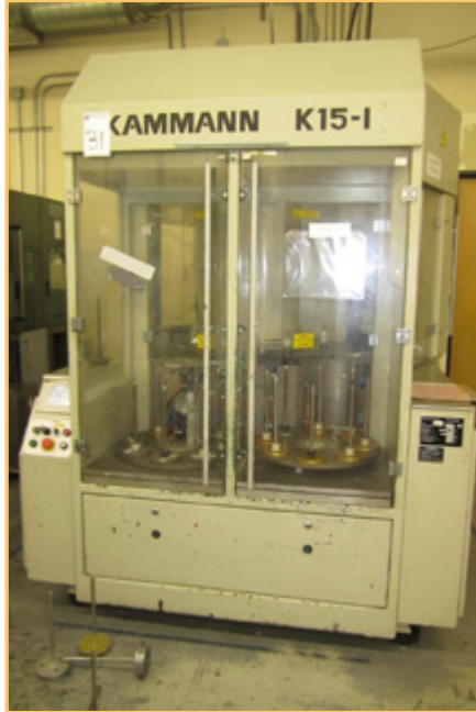
KAMMANN K-15-1 / 4.15.09HS CD SILK SCREEN PRINTER