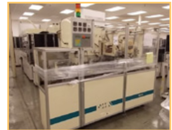
ALLIED TECHCUT4 PRECISION WAFER CUTTER