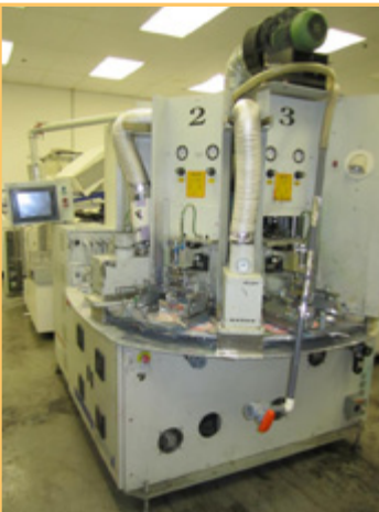
GUAN YINN GCD-2055 CD SILK SCREEN PRINTER, 5 COLOR