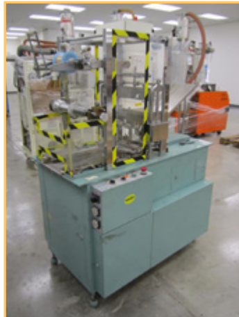
UGUST TECHNOLOGIES MODEL NSX-95 AUTOMATED DEFECT INSPECTION MACHINE