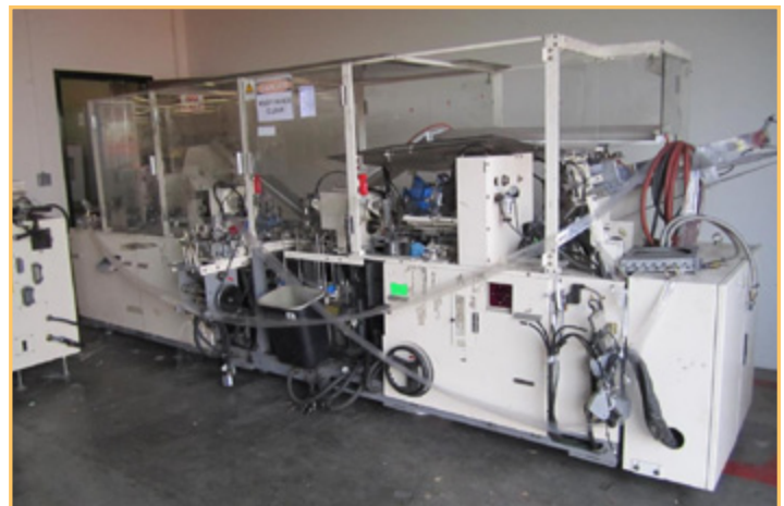
LANGEN KYOTO W3731 JEWEL CASE MACHINE