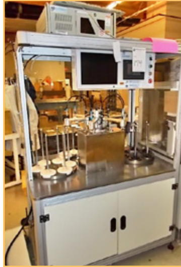
EE VISION DISC ID CHECKER / AUTO SORT