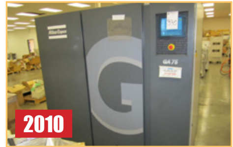
ATLAS COPCO GA75 PACKAGED AIR COMPRESSOR