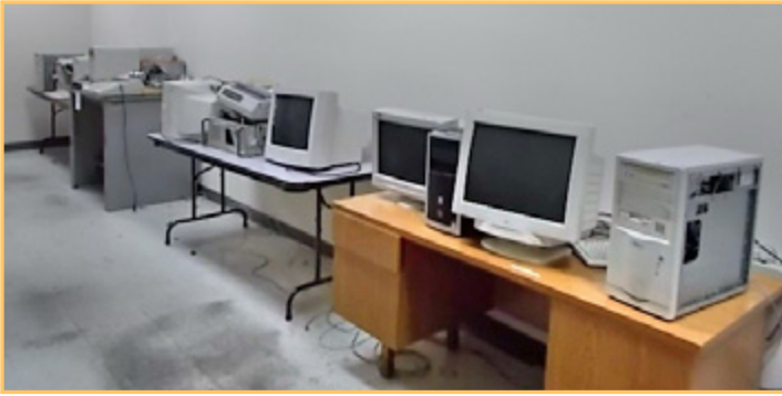
ASSORTED OFFICE EQUIPMENT AND FURNISHINGS