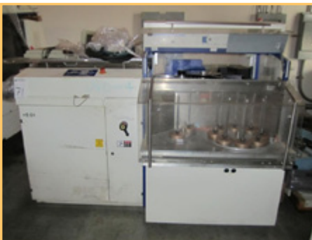
SINGULUS SKYLINE CD REPLICATION SYSTEM