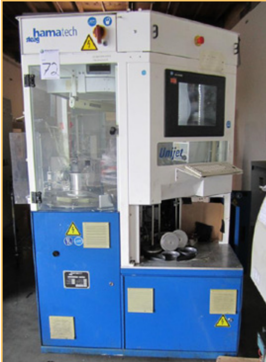
STEAG HAMMATECH UNIJET/60144 CD REPLICATION SYSTEM