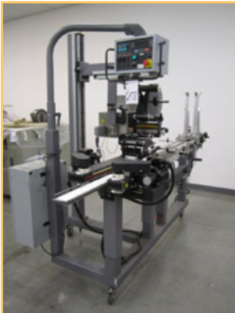
SOUTHERN CALIF PACKAGING EQUIP ST1100 LABEL APPLICATOR