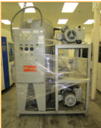
BUSCH VACUUM SYSTEM, WITH RECEIVER TANK