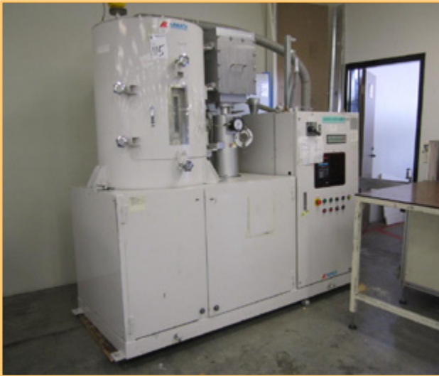
KAWATA CDA200U POLYCARBONATE MATERIALS DRYER