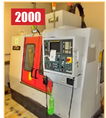
YANG SV-600 BUSINESS CARD CD CUTTER