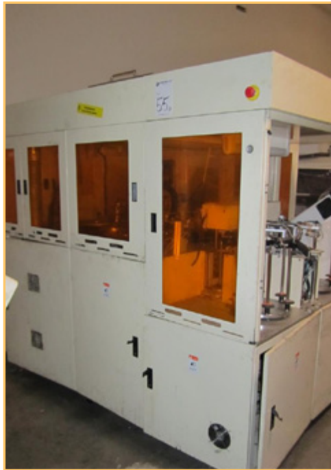
GUAN YINN# GDB2A DVD BONDING STATION AND GUAN YINN #GCL-1118 COOLING STATION