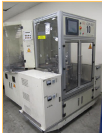
NANO METRICS STRATUS, FTIR WAFER THICKNESS TOOL