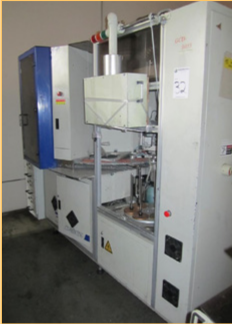
GUAN YINN GCD-3055 CD SILK SCREEN PRINTER, 5 COLOR