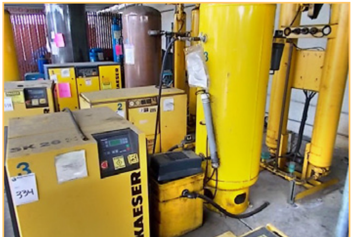
DEKKER VACUUM TECHNOLOGIES MODEL VMX0303KAI-00 CENTRALIZED VACUUM SYSTEM