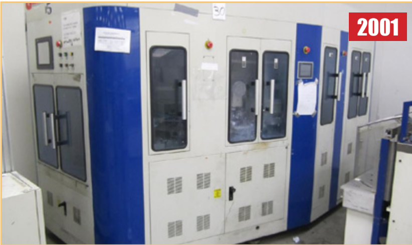
(6) GUAN YINN GFS-1001 CD DVD OFFSET PRINTER, 5 COLOR