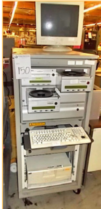
AUDIO DEVELOPMENT CATS DVD TEST STATION