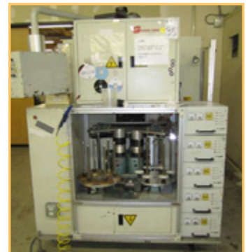
GUAN YINN GCD-2055 CD SILK SCREEN PRINTER, 5 COLOR