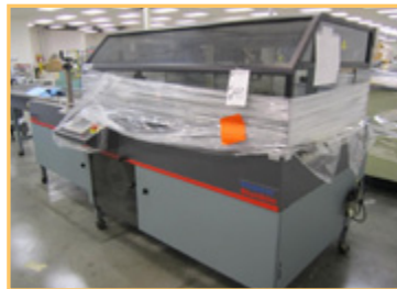
QUINCY QSVB15ACN3F VACUUM SYSTEM