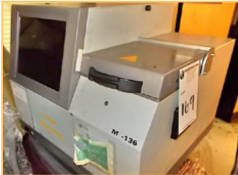
SVG8800 DUAL COAT TRACK SYSTEM W/ RESIST CABINET