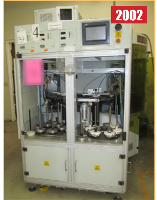
HANKY CD-5000-VE CD SILK SCREEN PRINTER, 5 COLOR, 2002