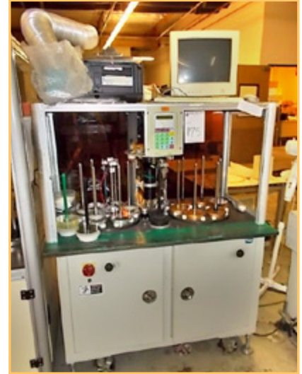
PHONE BIRD ID-1500 ID CHECKER / AUTO SORTER