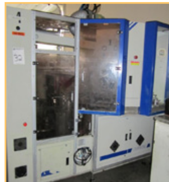
GUAN YINN GCD-3055 CD SILK SCREEN PRINTER, 5 COLOR