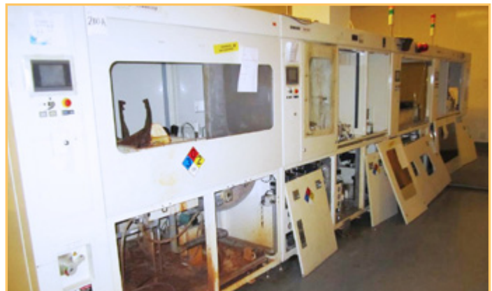
SONY CD GLASS MASTERING LINE, UPGRADED WITH SOLID STATE LASER AND ECLIPSE 8.0 CODER

Large Quantity Of Punches, Sanders, Cleaners, Coaters, Film Processors And Much More. Go Online For Complete Asset List.