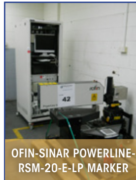
OFIN-SINAR POWERLINE-RSM-20-E-LP MARKER