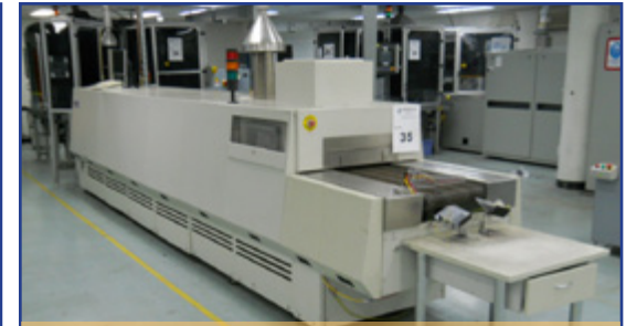
RTC D1215 4-ZONE IR DRYING OVEN