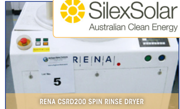
RENA CSRD200 SPIN RINSE DRYER