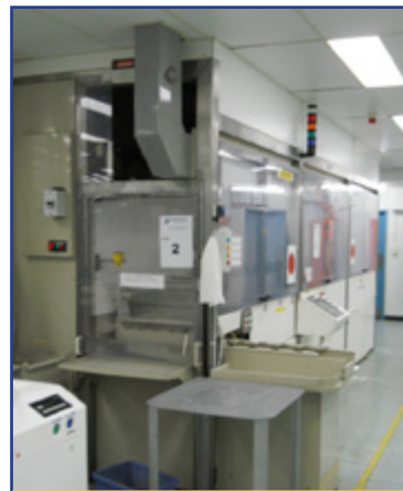
AUTOMATED INLINE WET CHEMISTRY SYSTEM