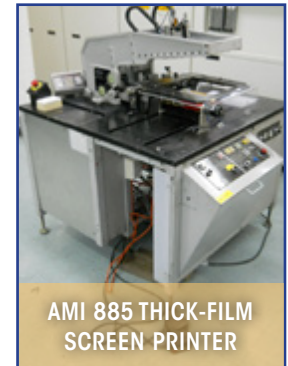
AMI 885 THICK-FILM SCREEN PRINTER