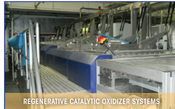
REGENERATIVE CATALYTIC OXIDIZER SYSTEMS