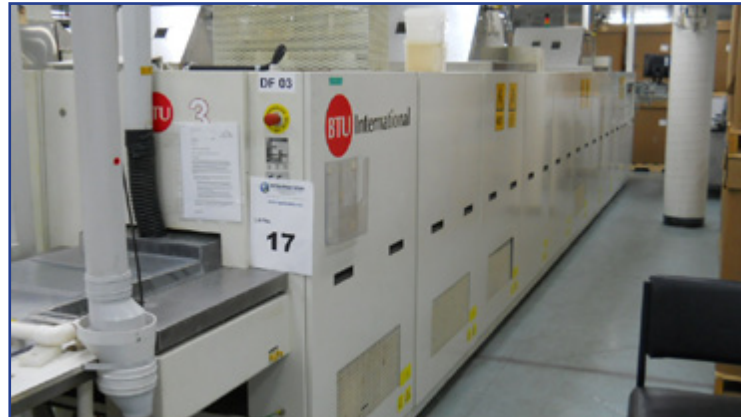
BTU INTERNATIONAL TQ161-8-240N48S DIFFUSION BELT FURNACE