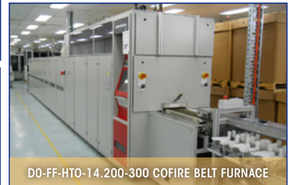
D0-FF-HTO-14.200-300 COFIRE BELT FURNACE