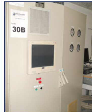
KINETICS AUSTRALIA GAS DELIVERY SYSTEM