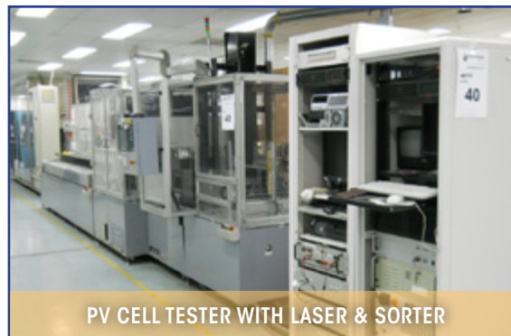
PV CELL TESTER WITH LASER & SORTER