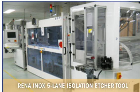
RENA INOX 5-LANE ISOLATION ETCHER TOOL