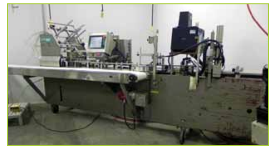
NORDALE CARTON FORMER, MODEL: MK11, SN: MK11E1297.