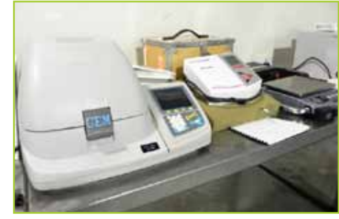
LAB EQUIPMENT: CEM SMART 5, PBI DANSESOR CHECKMATE 9900, LAB LINE INCUBATOR, DIGITAL THERMOMETERS. VAN GUARD MICROSCOPE, METTLER DIGITAL SCALE, ROBOT COUPE 3 CHOPPERS, TOP REG, KITCHEN AID AND OTHER MIXERS, AND DIGITAL SCALES, REFRIGERATORS, GARLAND GRIDDLE, RANGE, FRYER, AND HOOD