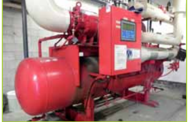
FES 200HP SCREW AMMONIA COMPRESSOR, MODEL: 180-HE, SN: 2052876, W/ CIRCULATION SYSTEM AND BAC EVAPORATIVE CONDENSER