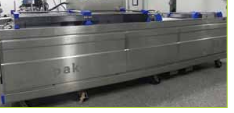
2007 REPAK VACUUM PACKAGER, MODEL: RF20, SN: 204019.