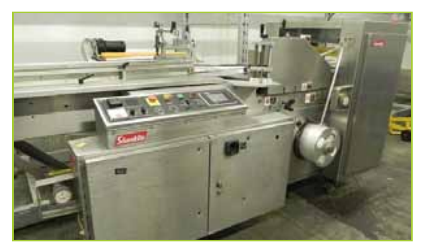
SHANKLIN FLOW WRAPPER, MODEL: F-555, W/ PLC CONTROLS, SCRAP WINDER, AND DAMARK HEAT TUNNEL