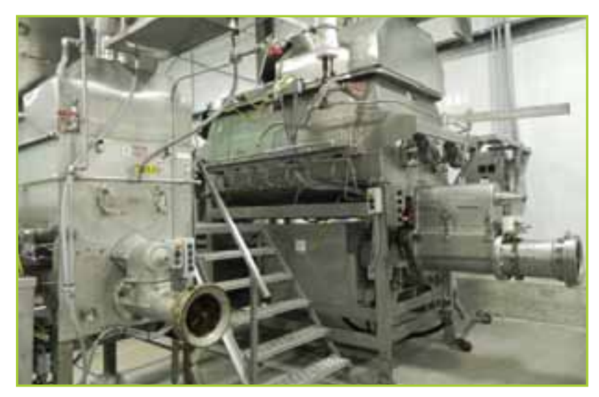
WEILER MODEL MG 1109 & 1612 GRINDERS, HOBART MIXER GRINDERS