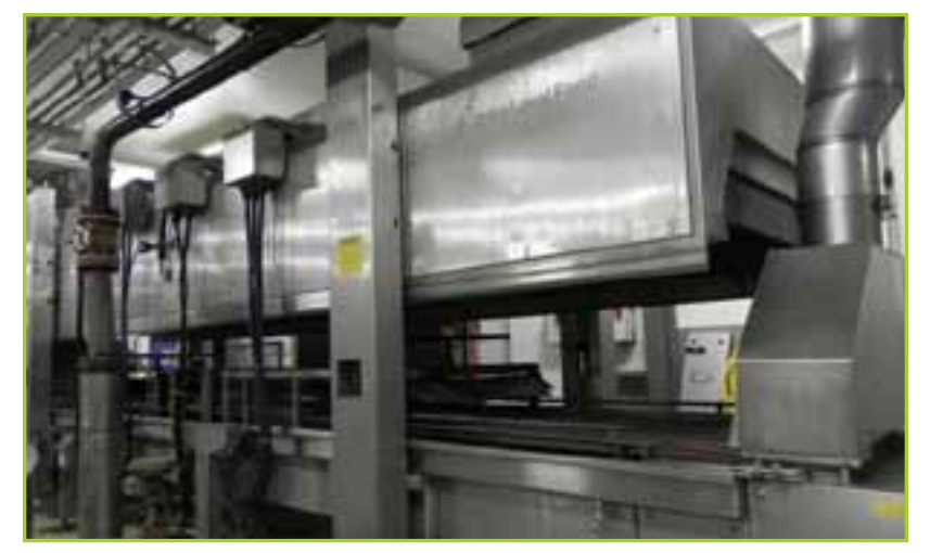
TETRA LAVAL / KOPPENS STEAM & ELECTRIC HLT S/S OVEN