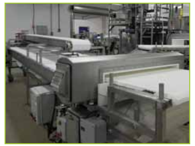
(8) METAL DETECTORS - LARGE ASSORTMENT CONVEYOR SYSTEMS

Formax Parts, Formax F19 and F 6 Tooling, Interlox and S/S Conveyor Belting, S/S Clad Motors, Hydraulic Components, Regulators, Sprockets, Grinding Plates, Bearings, Seals, Electrical Components, Floor Mats, Air and Water Hoses, Flammable Storage Cabinets, High Speed Roll-Up Door, Foamer Stations, Large Quantity S/S Tables, Plastic Tubs, 2 Way Radios, Battery Charges, Storage Cabinets, S/S Wash Sinks, Rubbermaid Trash Cans, Fiberglass Ladders, Refrigerators, Parts Machines, Washer and Dryer, Nobles Speedscrub Floor Scrubber, and Offices.