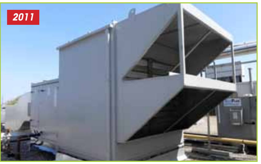
2011 ENGA NATURAL GAS AIR HANDLER