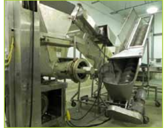
(9) GRINDERS, ASSORTED CONVEYOR SYSTEMS