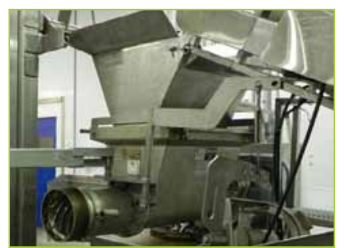
HOBART MIXER GRINDERS