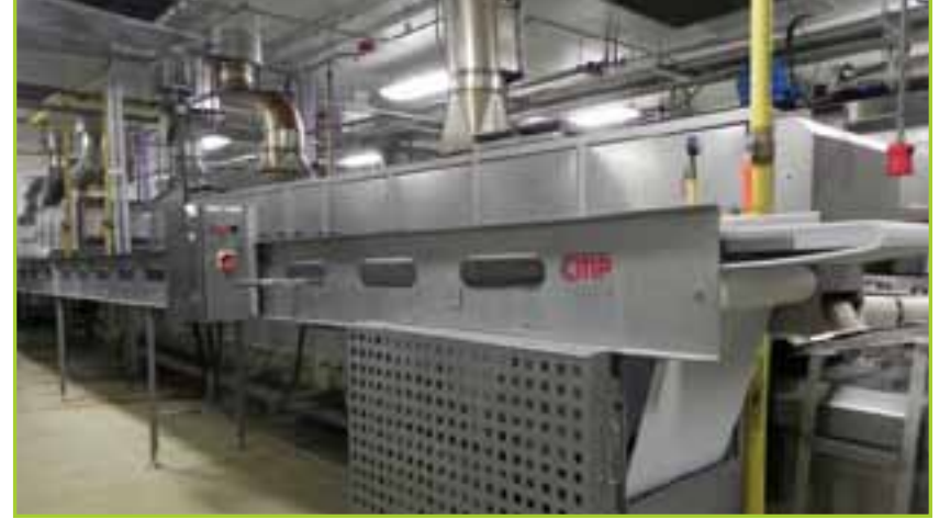
(2) BARRON INDUSTRIES GAS FIRED GRILLING OVENS, MODEL: GRILL IT 1222, SN: 12X2-2-C, 21 FT. LONG X 32" WIDE