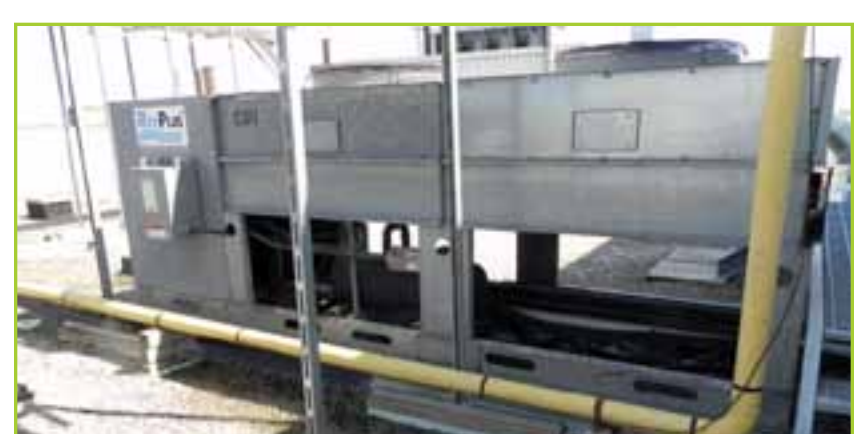
(29) KRACK, LARKIN, REF PLUS, AND KEEP RITE 2, 3, 4, 5, AND 6-FAN FREON COOLER AND FREEZER BLOWERS WITH COMPRESSORS AND EVAPORATORS.

To view a complete asset list, visit our website @ www.hgpauction.com