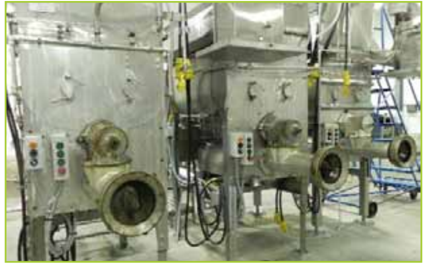
(4) HOBART MODEL 4356 MIXER / GRINDERS