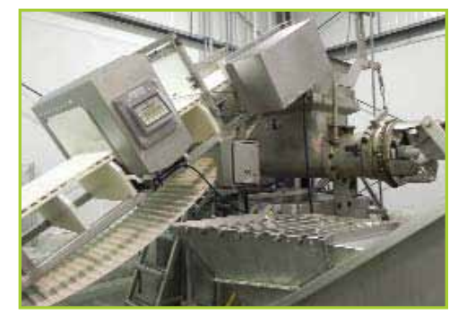
GRINDER & METAL DETECTOR