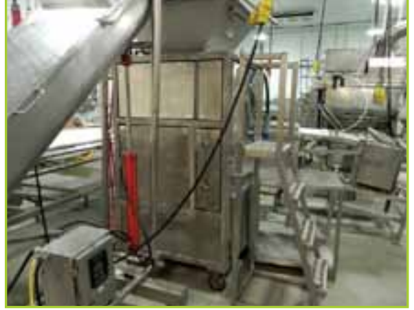
BRIDGE MEAT BALL FORMER MODEL BT-004, S/N 2500SNR

STEIN DEEP FRYER, MODEL: HPF114405G, SN: 462, W/ HYDRAULIC SYSTEM, FILTERS, AND S/S TANK