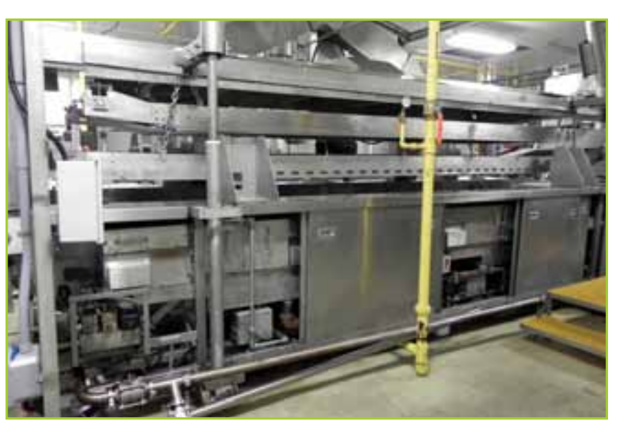
TETRA LAVAL FOOD KOPPENS S/S HLT OVEN, MODEL: HLT 8000/1000, SN: HLT 8000/1000-153, W/ ALLEN BRADLEY CONTROLS, 40 FT. LONG X 40" WIDE

Safeline Mettler Toledo Metal Detector, with 25.5" x 3.75" Aperture. (6) Safeline Metal Detectors, with Apertures of: 25.75" x 10.75", 25.75" x 9.75", 31.5" x 5", 37.5" x 3", 39" x 2" and 39" x 1".