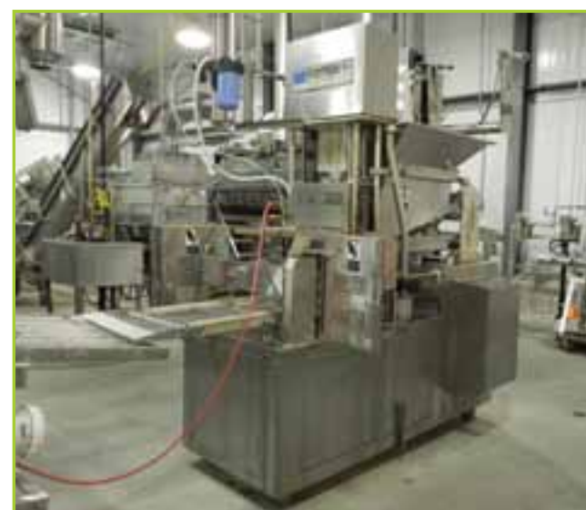
(2) FORMAX PATTY FORMERS MODEL PFM19, S/N 306 AND MODEL F19 S/N 428, WITH TENDERFORM SYSTEM, CUBERS, AND DUMPERS