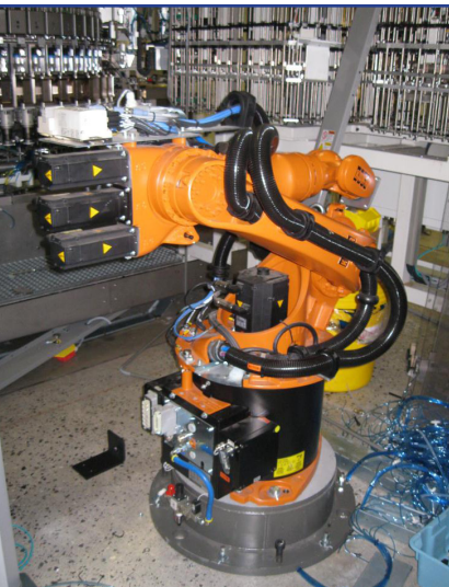
Kuka KR-16 Roboter with Controllers