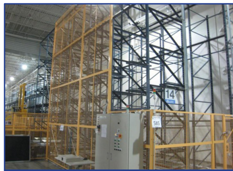
Muratec Lot: ASRS207, Storage Retrieval System