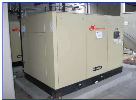
INGERSOLL RAND HH400W Air Compressor (Qty. 2)