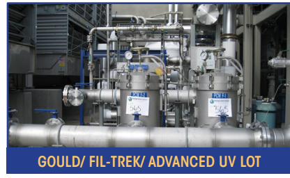
GOULD/ FIL-TREK/ ADVANCED UV LOT