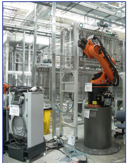
Kuka KR 30-3 Roboters