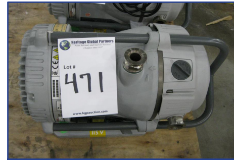
Edwards x10i Scroll Pump