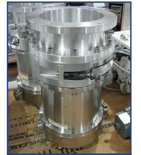
Edwards STP-A1303C Pump