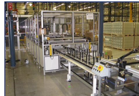
Glass Inspection Tool (Qty. 2)