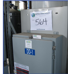
CAB 2000 Air Dryer Chamber