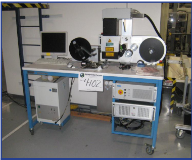
CAB FL10PCI Lot: Laser Label Printer