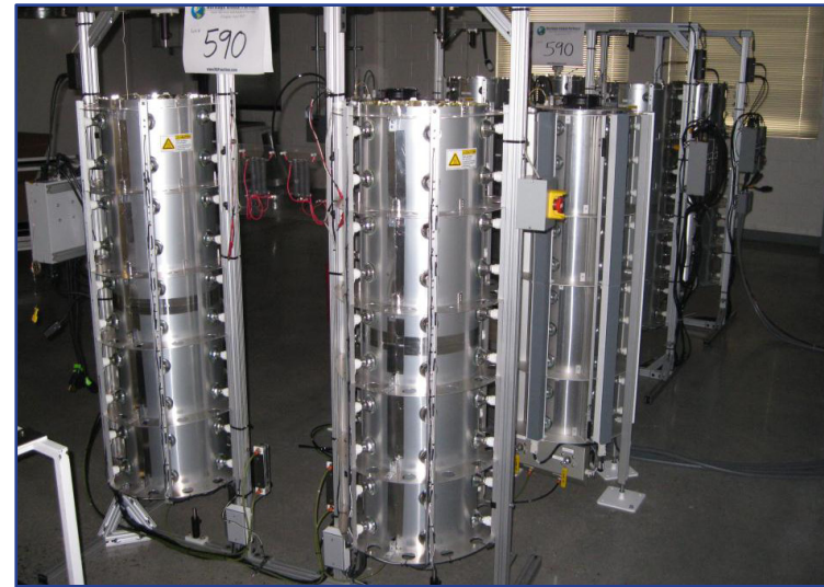
Light Cell Test Stations Lot: 8 Light Cylinder