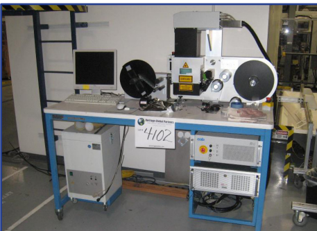
CAB Label Maker LM2