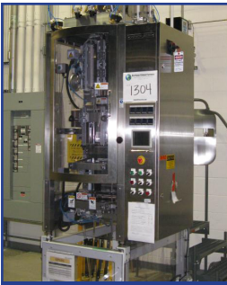
Orihiro ONP-2030AS2, Qty. 10