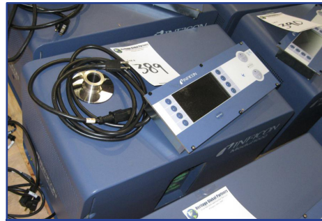
Inficon 550-300 Modul 1000 Helium Leak Detector