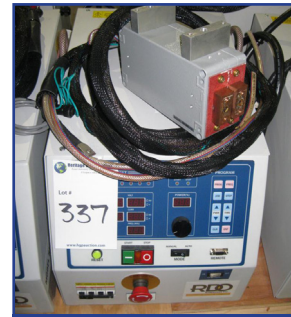
RDO 5-135/400-3 HFI Unit