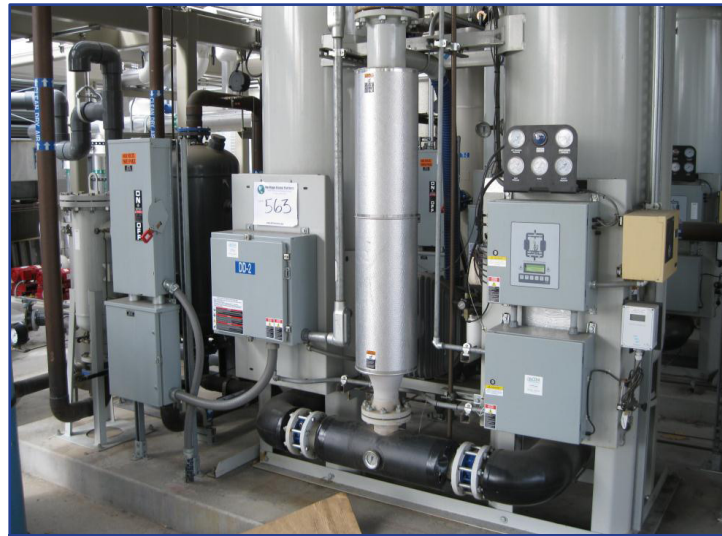
PNEUMATIC PRODUCTS CAB 2000 Air Dryer