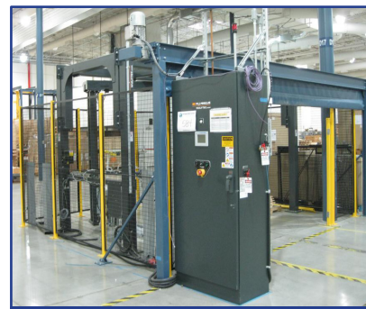
M.J. Mallis WCRT-200 Shrink Wrap Machine