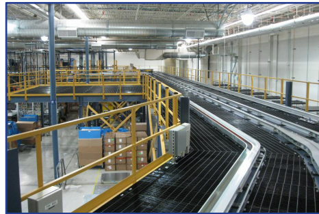
Mezzanine Lot: AGV Track, and Retrieval System