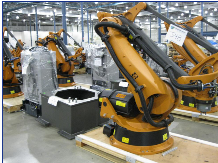
Kuka KR-100/180-2 PA Kuka Roboters