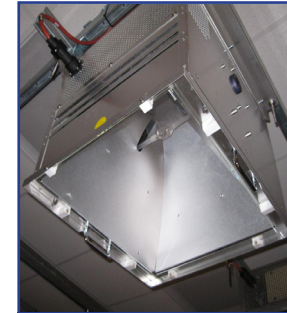
Solar Test Light Fixtures