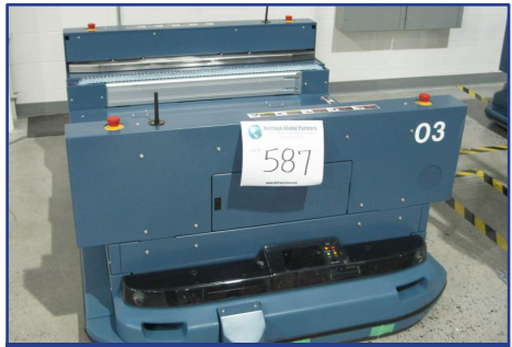
Muratec SX-1000-C Lot to include (4) AGV's Premex