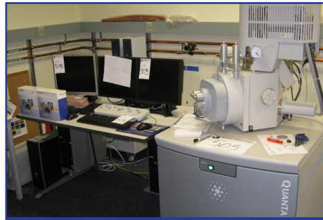
FEI Quanta 450 FEG Scanning Electron Microscope