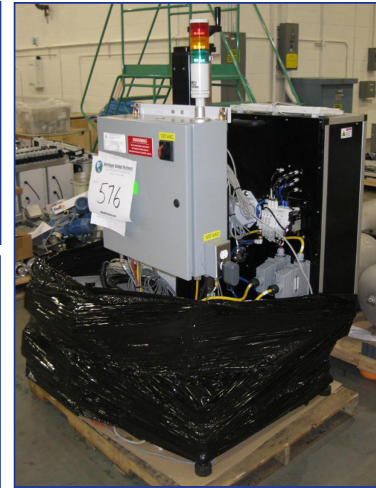
Laser Tamp Kit/ Applicator