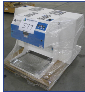
Air Science USA Flow Hoods