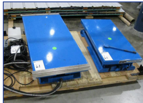
Bishamon LX100NBI/ AB-1634/ X30S Lift Tables Lot