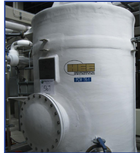
Hee Environmental Storage Tank