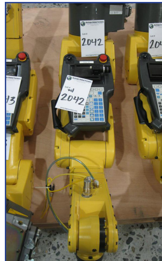
Fanuc LR Mate 200iC 5L Robot (Qty. 4)