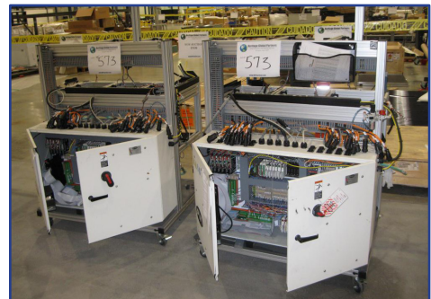
Tenney TPS ETCU110-RSWS Environmental Chamber